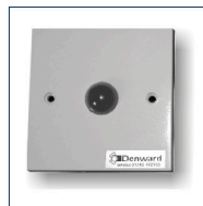
FPD-3823 CD Cabinet Alarm Light