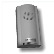
FPD-3822 CD Cabinet Alarm

(These accessories can only be fitted when ordered with cabinet)