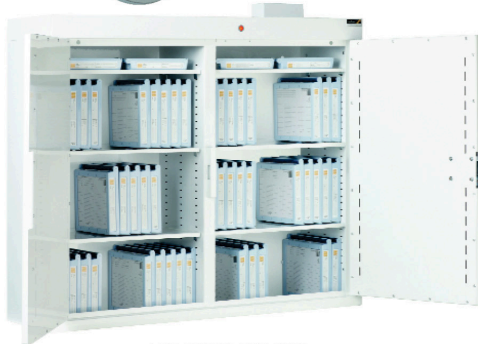
FPD-6487 & FPD-6281

Optional 12V DC External Warning Light Must be ordered with cabinet