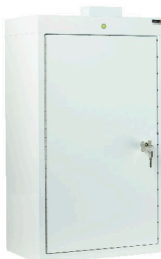
FPD-6494 & FPD-6281 Above cabinets shown with left hand hinge option