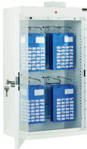
FPD-6484 & FPD-6281