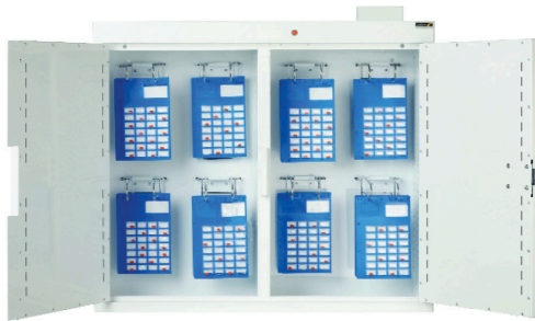
FPD-6487 & FPD-6281

Our range of high quality medicine cabinets conform to or exceed the British Standards (BS 2881:1989 Security Level 1). They are ideal for use in nursing homes and care homes where drugs are being administered using the Monitored Dosage System (MDS) and NOMAD Cassette systems. The MDS cabinets are designed to work in conjunction with Manrex (Boots) and Venalink plus a range of other systems