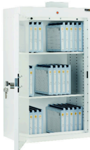
FPD-6494 & FPD-6281