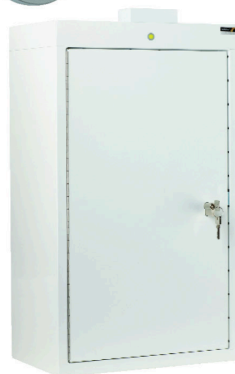
FPD-6295 & FPD-6281

Above cabinets shown with left hand hinge option