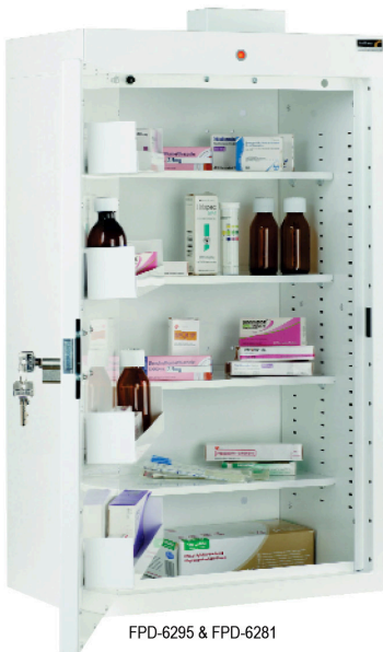
FPD-6295 & FPD-6281