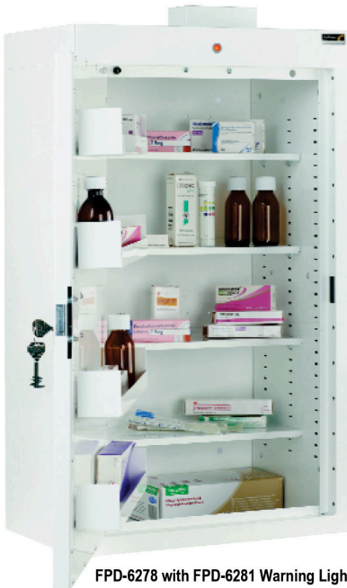
FPD-6278 with FPD-6281 Warning Light

Our range of high quality controlled drug cabinets conform to or exceed both the Misuse of Drugs (Safe Custody) Regulations 1973 and British Standard (BS 2881:1989 Security Level 1). They are therefore suitable for use in health centres, hospitals, nursing homes, prisons, vets and other health care buildings.