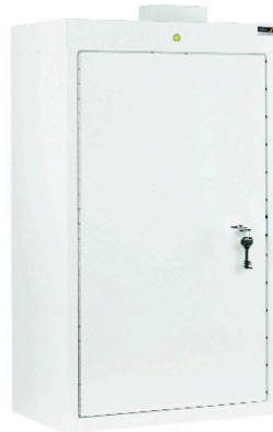
FPD-6278 with FPD-6281 Warning Light

Optional 12V DC External Warning Light Must be ordered with cabinet