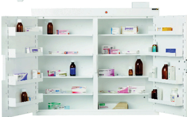
FPD-6279 with FPD-6281 Warning Light